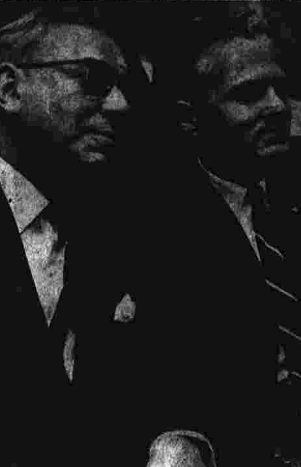
Hoping for Better Reports Senator William Purtell and Congressman Ed May, Republican...