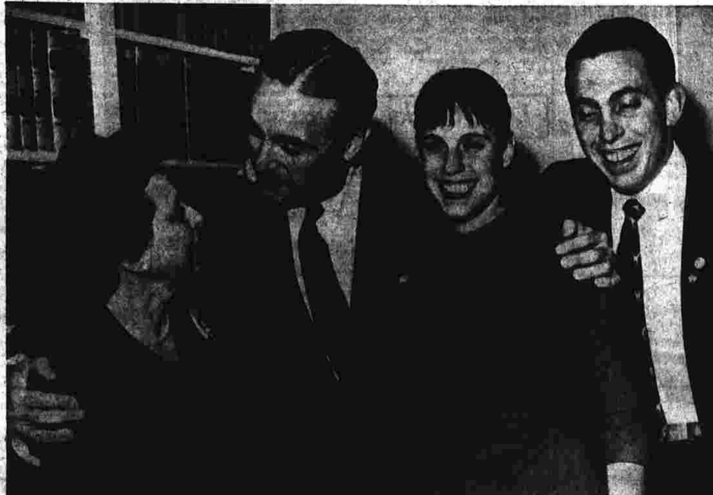
The State's first family rejoices after Gov. Ribicoff learns of his reelection yesterday by a whopping plurality...